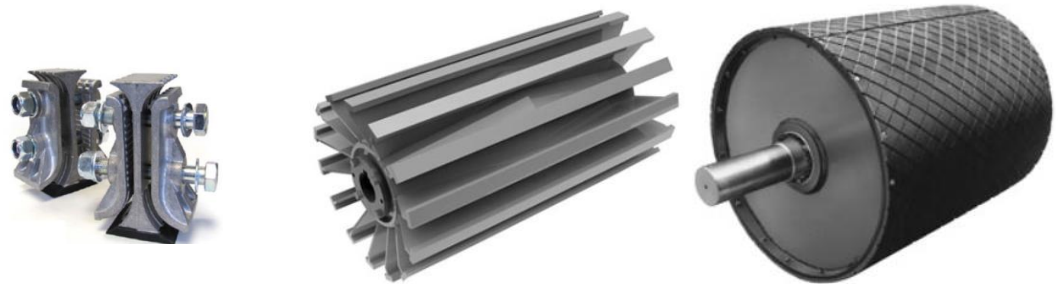
Winged and lagged drum pulleys

STEP 3. Choose Your Bucket Material Buckets are available in the following materials: Polyethylene, Nylon, Urethane, FDA Nylon, plus ductile iron and steel for industrial applications.