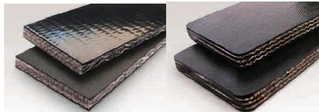
Interwoven –constructed PVC and Plied Rubber belting available

908 Jeffco Executive Dr. Imperial, MO 63052 Fax: 636-741-5701 accurateindustrial.com