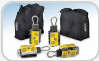
Smart Clamp™ Belt Clamps