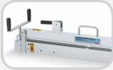
Clipper® 845LD Belt Cutter

The Flexco Laser Belt Square can be used in conjunction with these Flexco products to keep belts up and running at peak performance.