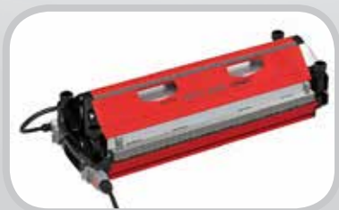
Novitool® Aero® Splice Press