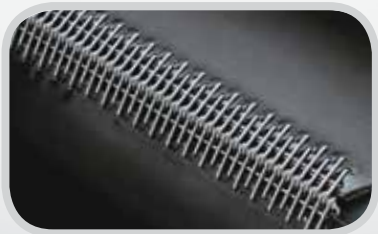
Clipper® Wire Hook Fastening System